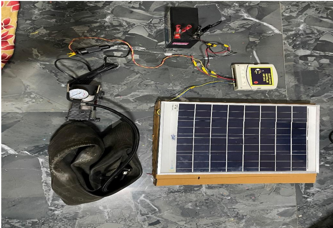
Fig.2: Actual Setup Diagram