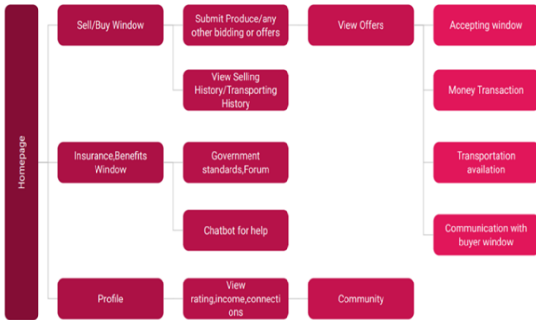
Fig 2: Overview layout of app