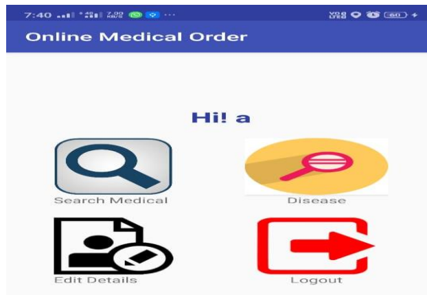
Fig.1: Online Medical Order