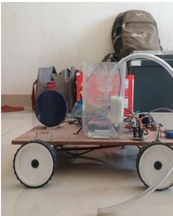
Fig. Result 1

The multi-function agricultural robot integrates soil moisture sensing, automatic irrigation, seeding, and grass cutting into a single compact system controlled by an Arduino Uno. Using 100 RPM DC gear motors for locomotion, SG90 servo motors for sensor and seed deployment, and a relay- controlled mini water pump, the robot performs tasks autonomously in a cyclic manner.