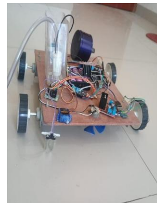
Fig. Result 2

Testing demonstrated accurate soil moisture detection, efficient water usage, uniform seed placement, and continuous grass cutting during movement. The system reduces manual labor, improves precision, and optimizes energy consumption, highlighting the potential of automation in small-scale farming. Overall, the project showcases a cost-effective and practical approach to smart agriculture.