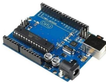
Fig.1 Arduino Uno

It comes with 14 digital input/output pins, 6 analog inputs, a 16 MHz quartz crystal, a USB connection, a power jack, and an ICSP header for programming the microcontroller with an external programmer. The digital pins on the Arduino Uno can function as either inputs or outputs, allowing you to control various electronic components such as LEDs and motors. Meanwhile, the analog inputs enable you to read values from sensors, including temperature and light sensors. To program the board, you can use the Arduino programming language, which is based on C++. The software for the Arduino, which is free to download, includes a user-friendly integrated development environment (IDE) that simplifies the process of writing and uploading code to the board.