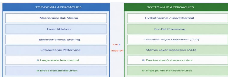
Figure 1: Hierarchical classification of synthesis strategies for nanostructured inorganic energy storage materials, illustrating the spectrum from top-down to bottom-up approaches and resulting nanostructure dimensionalities.

Sol-gel processing offers exceptional homogeneity at the molecular level by hydrolyzing and condensing metal alkoxide precursors to form a three-dimensional gel network that is subsequently dried and calcined to yield nanocrystalline metal oxide powders. The method allows precise control of stoichiometry, doping, and porosity through careful manipulation of precursor chemistry, hydrolysis ratio, and thermal treatment conditions. Chemical vapor deposition (CVD) and atomic layer deposition (ALD) are gas-phase methods that enable the deposition of highly uniform thin films and conformal coatings with atomic-level thickness control, making them invaluable for electrode surface modification and nanostructure fabrication. Electrochemical deposition offers the unique advantage of directly depositing nanostructured active materials onto current collectors without requiring post-synthesis transfer, preserving intimate electrical contact and enabling in situ control of film thickness and morphology.