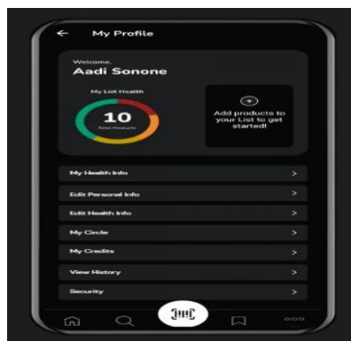
Fig.2 User Profile Page

FIG.1 shows that the app welcomes users with a "Welcome!" message. Fields for Username and Password are present. Options for Log in, Forgot Password, and Create Account are displayed. The design features a dark theme with white text and buttons.