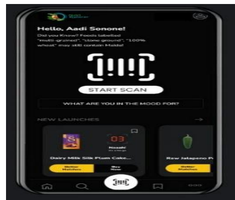
Fig.3 Home Screen

FIG.2 Displays the user's name (Aadi Sonone). Shows a health score or product list count (10 total products) in a circular progress indicator. Buttons for editing health info, personal info, viewing history, and security settings. A section prompting the user to add products to their list.