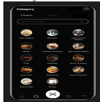
Fig.4 Category Selection Screen

FIG.3 shows that our model greets the user and provides a health tip. Features a large barcode scanner button for scanning products. A search feature with "What are you in the mood for?" Displays new product recommendations with buttons for viewing better matches.